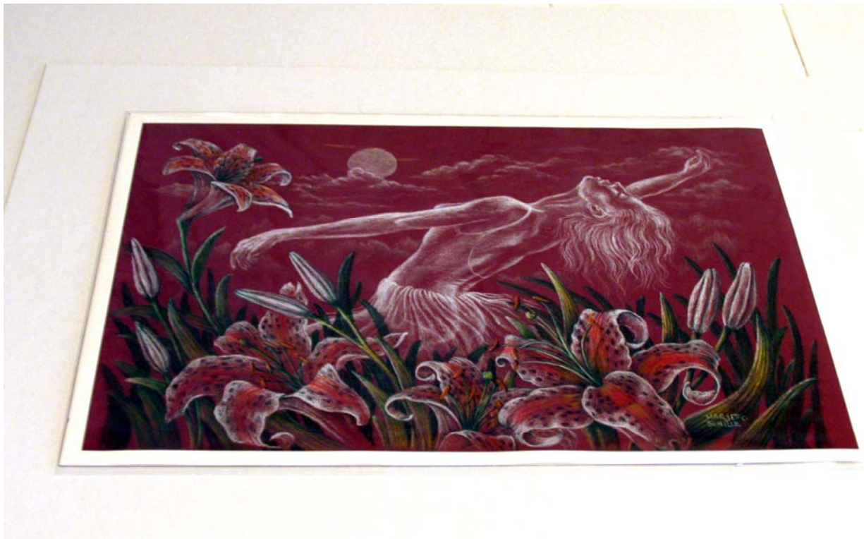
Ready to package inside the 2 "Shipping" backer boards.