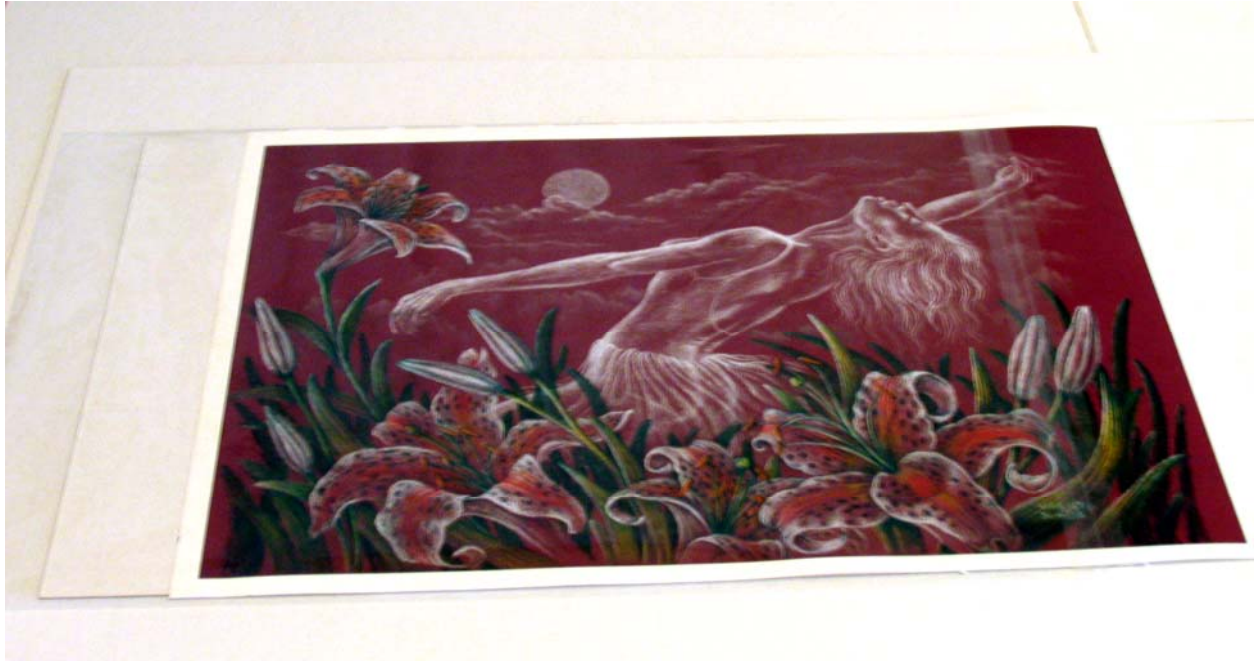
Inserting Print into Clear Bag Envelope with Backer Board